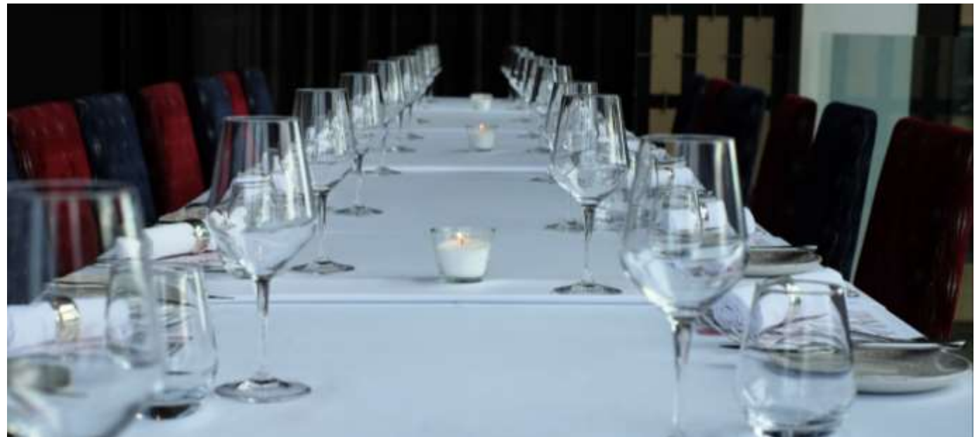
Above: Semi Private Bay View Space