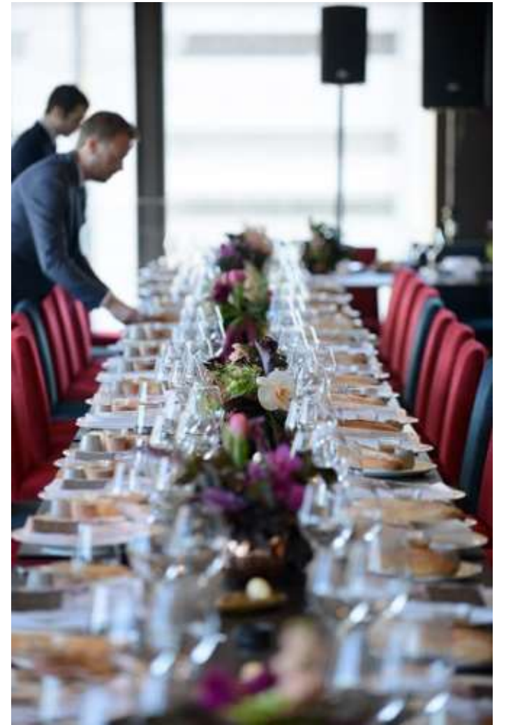
Above: Semi Private City View Space / Private Bayview Space / Full Restaurant Bookout – One Long Table