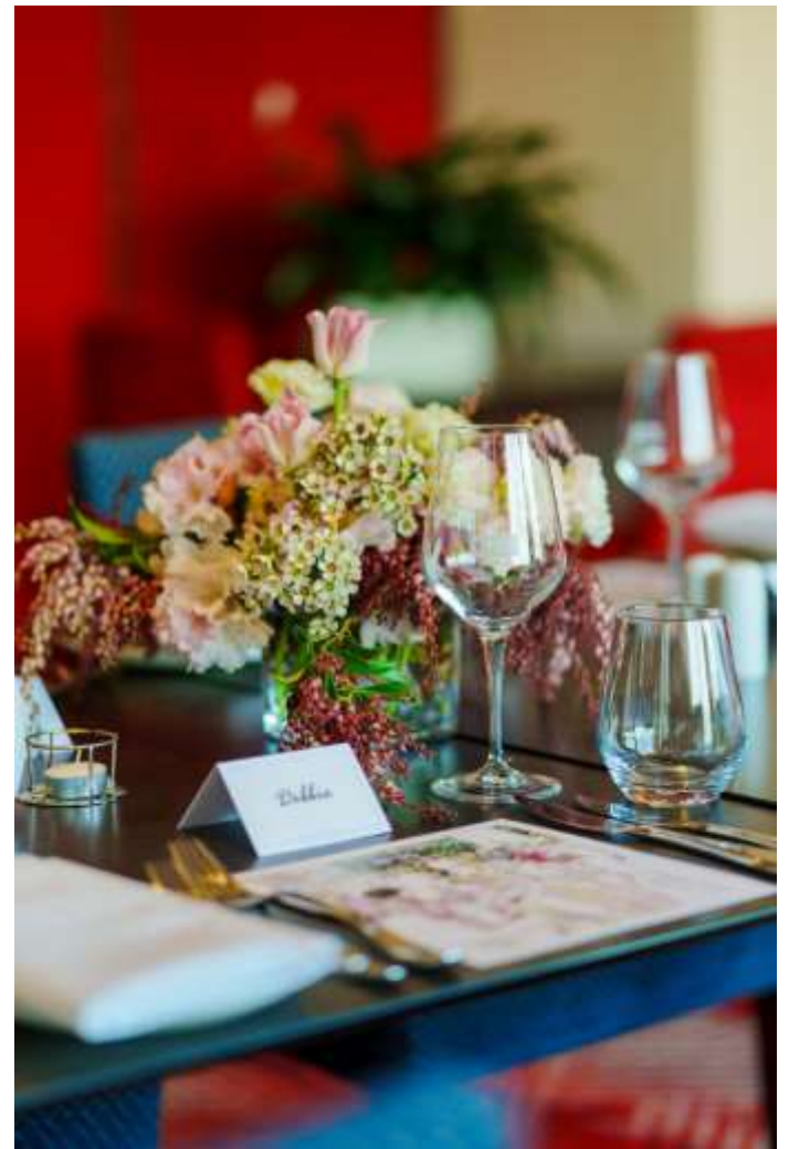
Above: Event Examples