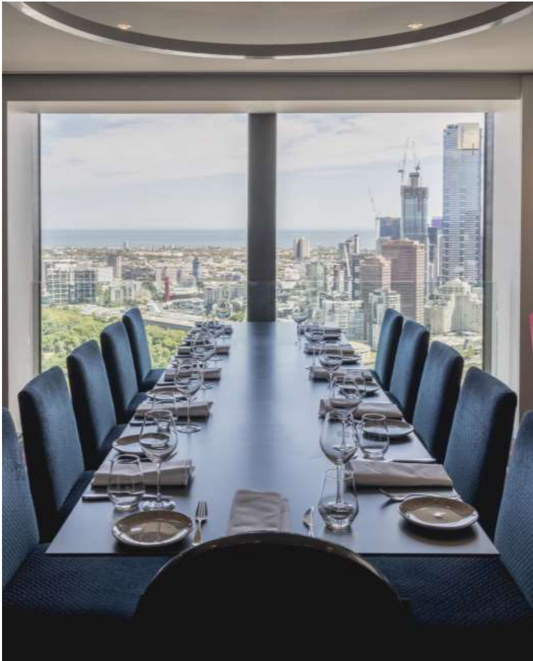
Above: Semi Private Bay View Space