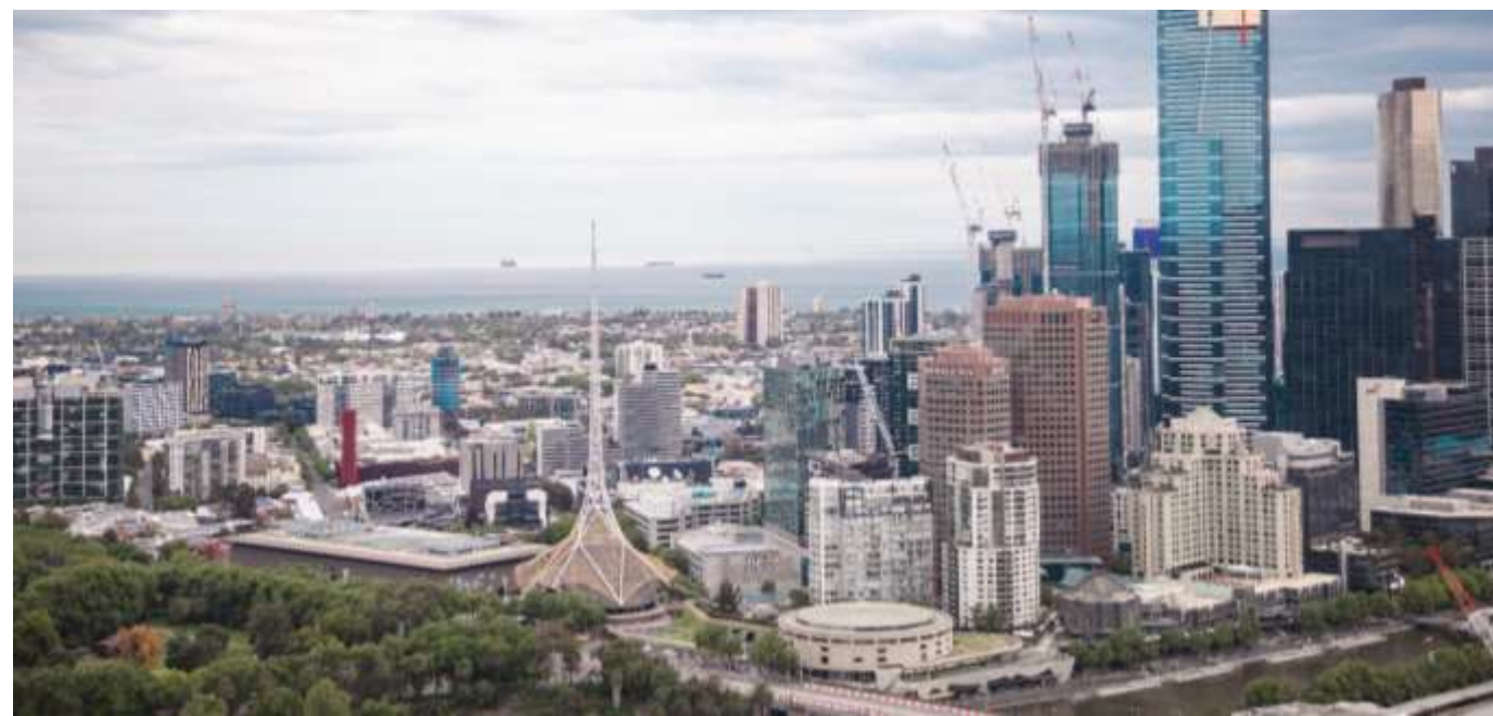
Above: Semi Private Bay View Space